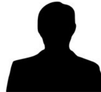
A N Other Website Support